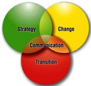
The Integrated Approach to Leading Change™

Wherever you look today, our world is going through a time of unprecedented change. Whatever your industry, whatever your geographical location, whatever your job title, you are faced with constant change. Statistics show that two out of three major organizational changes fail. Improve your odds for success by learning how to internally guide your organization through change.